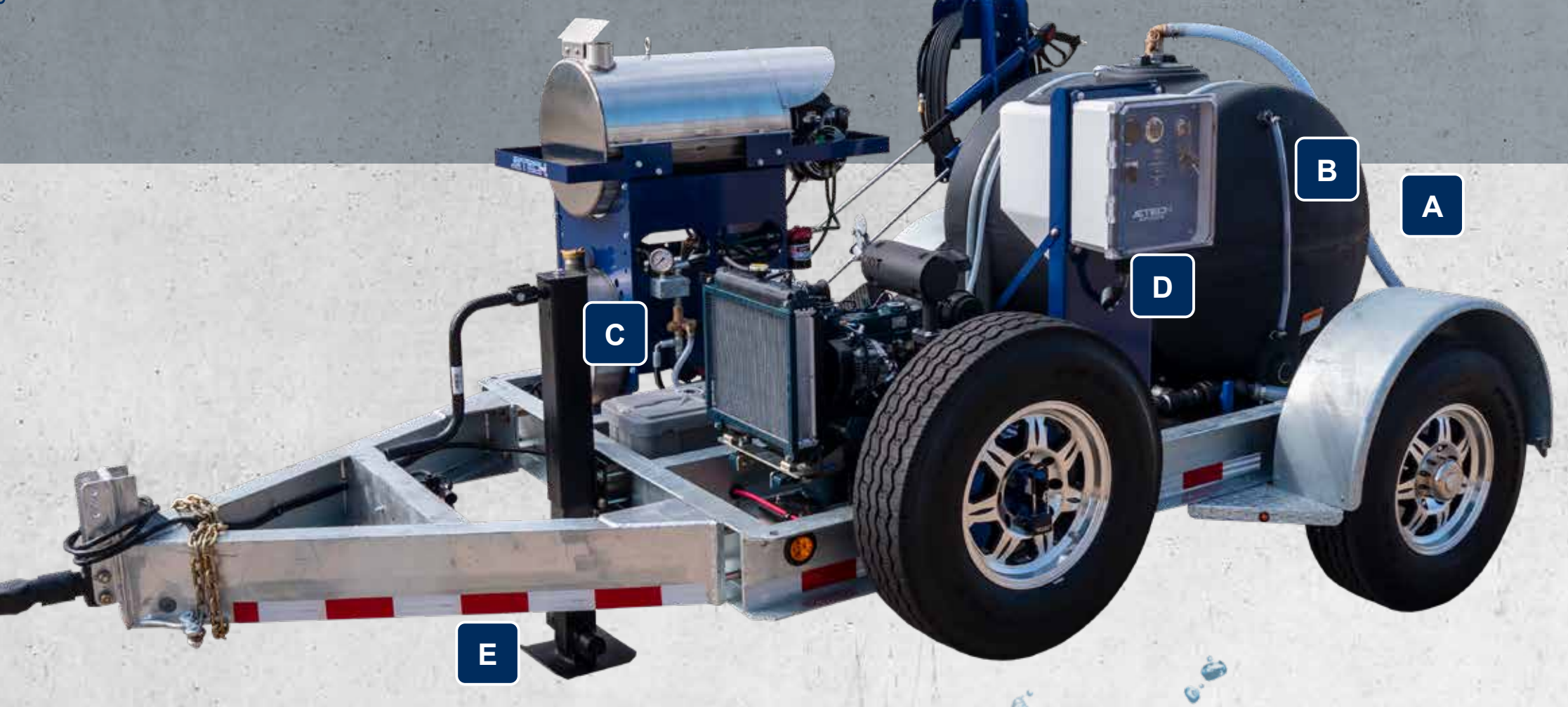
Single Module on Dual Axle Trailer

The dual-axle XP305 can be configured with single, dual, or even triple modules all on the same compact trailer, increasing productivity while reducing the need for additional systems.