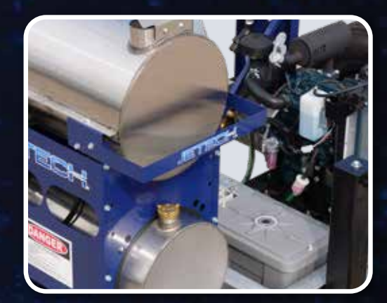
Black Water Tank with Filter and Sight Gauge