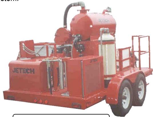
CRW 2000 (TRAILER OPTIONAL)